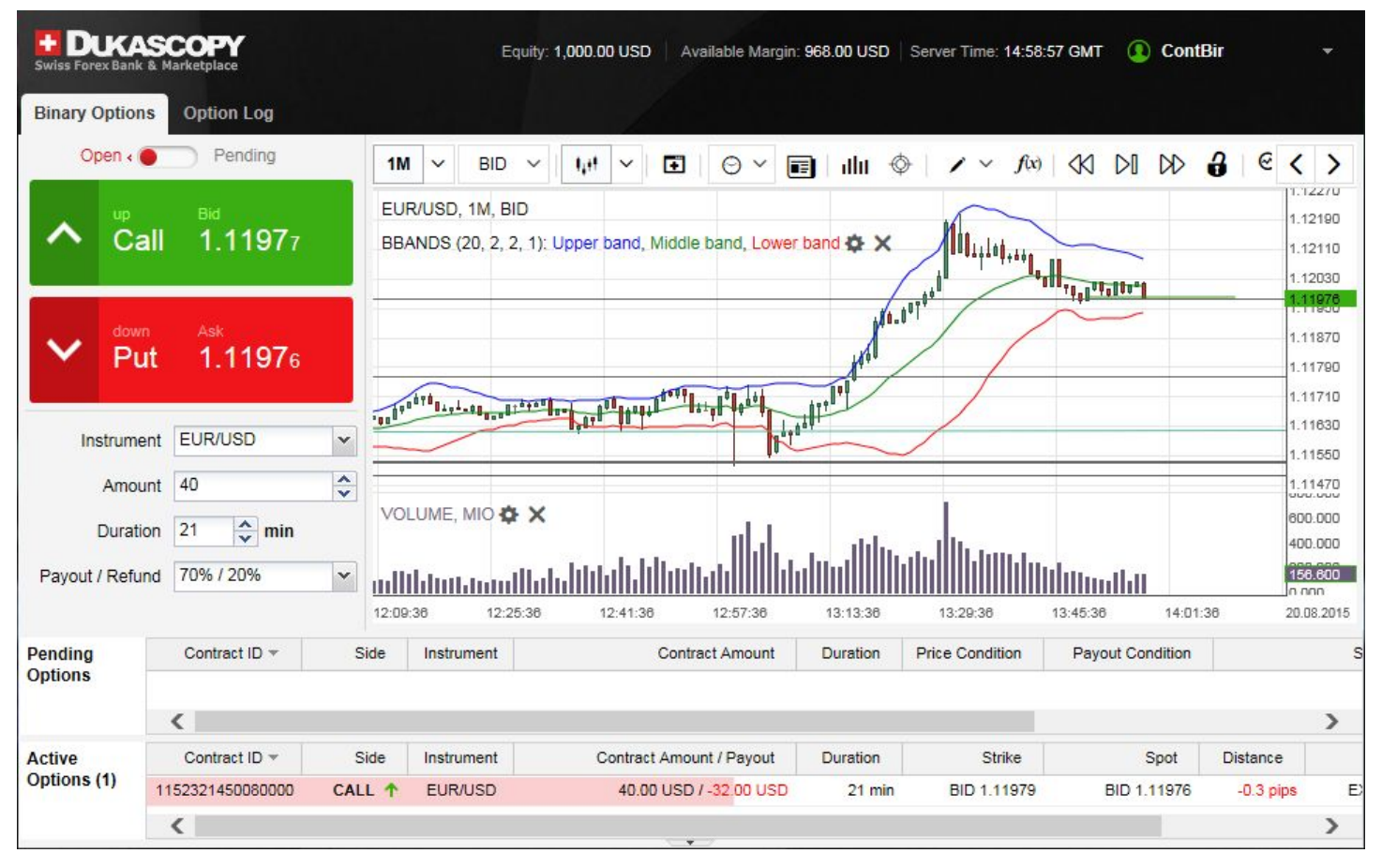
The 30min Binary Ascend buy signal ends out of the money... my 21min call option is a winner...!!