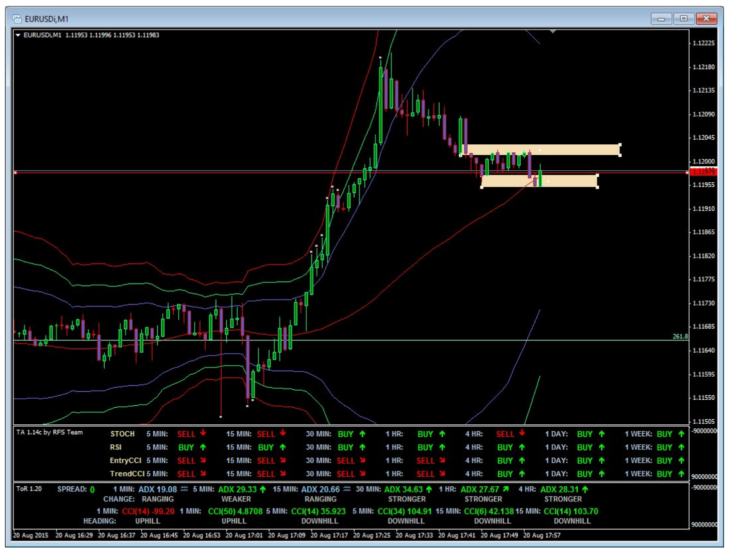
Binary Ascend deliver a 30min buy signal at 17:44... I wait 5 mins and initiate a 21min call option...